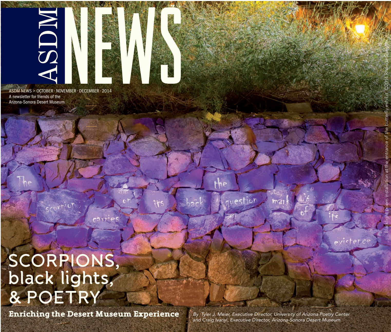
Blacklight poem installation at the entrance of the butterfly exhibit.

ASDM NEWS > OCTOBER · NOVEMBER · DECEMBER · 2014 A newsletter for friends of the Arizona-Sonora Desert Museum